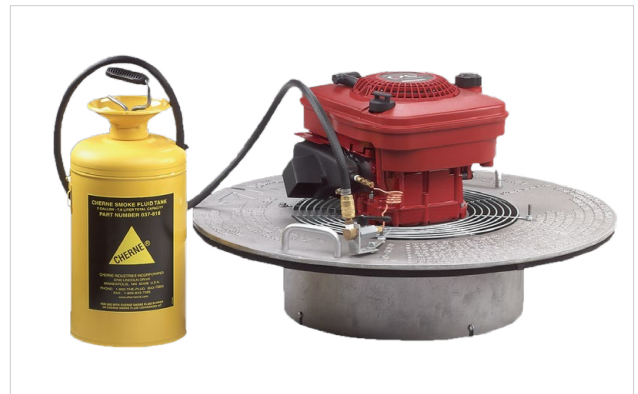
TABLE 1 Products available