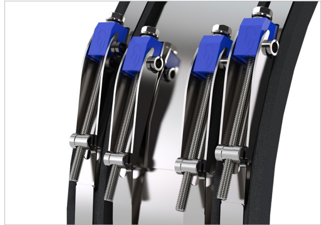
FIG. 1 Fernco Large Coupling bolting system