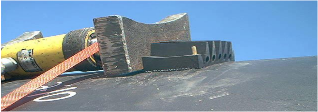
FIG. 1 Electrofusion Flex Restraints Tested to 10,000 lbs Axial Force

Georg Fischer Flexi Restraint Fittings are an excellent alternative to using ductile iron spool pieces when a PE pipeline needs restraint.