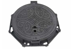
FIG. 2 DIMHMCFTCCSTW