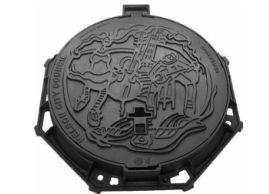
FIG. 6 DIMHMCFHSSTWNCC