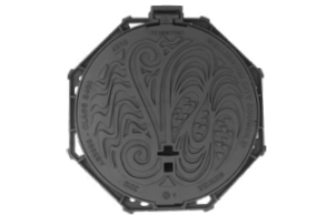
FIG. 5 DIMHMCFHSSEWWCC