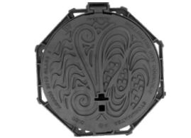
FIG. 4 DIMHMCFHSSTWWCC