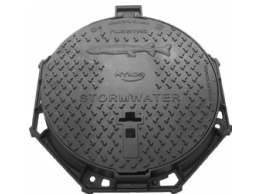
FIG. 8 DIMHMCFHSSTWCCC