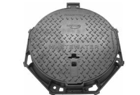
FIG. 9 DIMHMCFHSWTWCCC