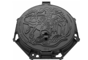
FIG. 7 DIMHMCFHSWTWNCC