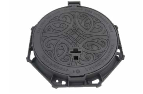
FIG. 3 DIMHMCFTCCWW