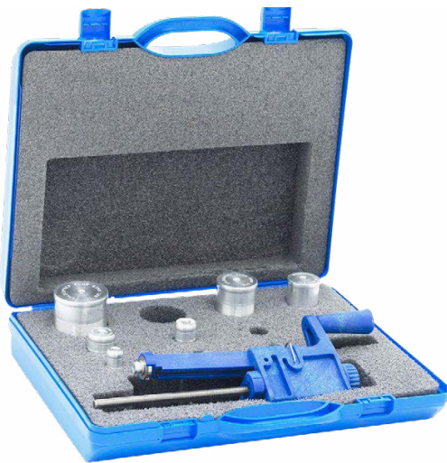
FIG. 1 Calderprep™ Plus Tool Kit