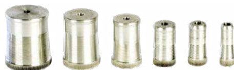
FIG. 3 Squeeze Off Tool Hydraulic 63-180-75-200