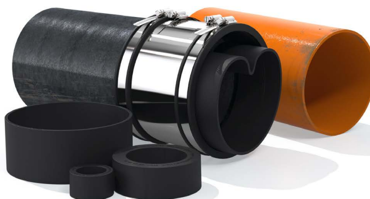
TABLE 2 Examples of Common Shear Band Bushes to suit S1 PVC to Concrete