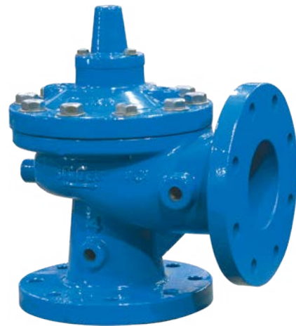
FIG. 1 Alternative models A206-PG Angle