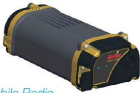
Itron Mobile Radio (actual size: 3.20" W x 5.66" L x 1.53" H)