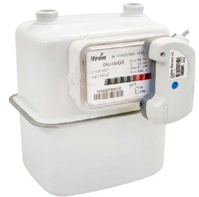
Gas meter equipped with cyble sensor module