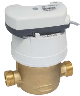
Water meter equipped with cyble sensor module