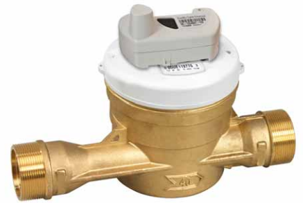
EverBlu Cyble Enhanced fitted on Commercial and Industrial water meter