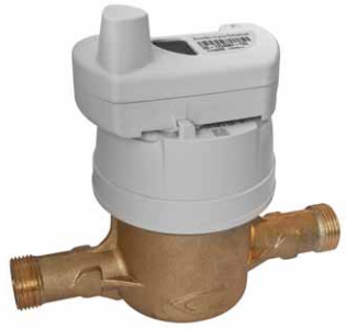
EverBlu Cyble Enhanced fitted on Residential water meter

The EverBlu Cyble Enhanced is suited to various applications for residential, commercial and industrial uses.