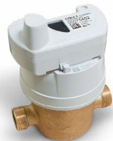
Aquadis+ equipped with the Cyble 5 module