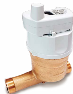
TD8 equipped with the Cyble 5 module